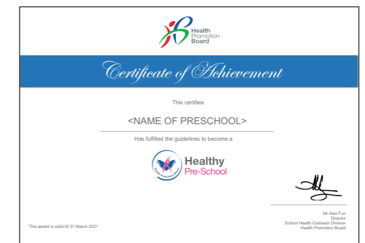
Diagram 2: Certificate of Achievement for Healthy Pre-school with validity period of two years (For Platinum Tier only)