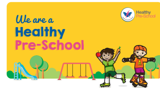
Diagram 1: Healthy Pre-school Decal (For both Basic and Platinum Tiers)