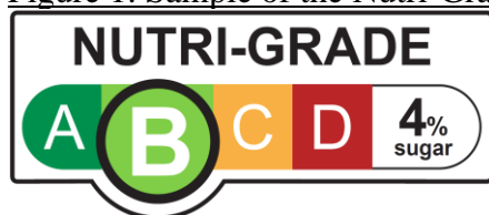
Figure 1: Sample of the Nutri-Grade label 6

There are thresholds for free sugar and saturated fat content that correspond to each grade, and these apply to all beverage types. The thresholds are found in Table 1.